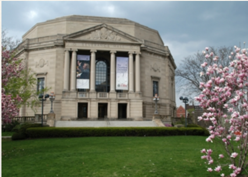
Case Western Reserve Cleveland, OH 4,661 students Private $43,158 tuition and fees